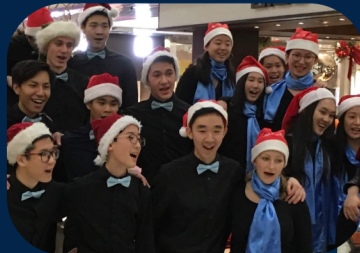
Chamber Choir at Oakridge Mall

Annual retreats and tours are anticipated highlights for Point Grey Music students, in addition to regular classes and concerts held at school. The focus is on building friendships within the music student community as well as continuing to develop techniques and skills. Some ensembles are also occasionally invited to perform at festivals held throughout the Lower Mainland and beyond.