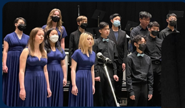
Choir and Jazz