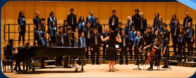
Chamber Choir performing at UBC's Chan Centre