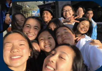
Point Grey Music on tour in Whistler