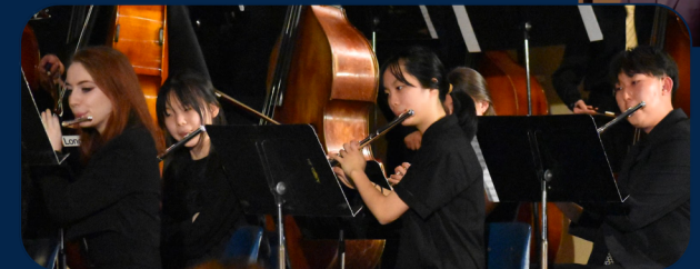
Symphonic Band in concert at the Point Grey Auditorium