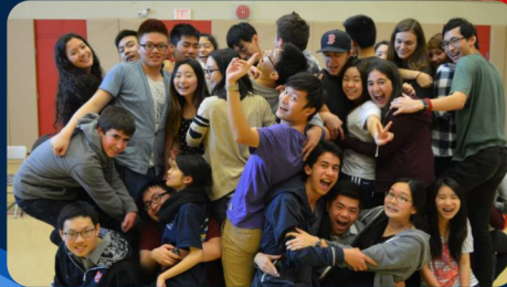
Students at Loon Lake Retreat